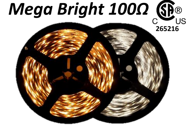
Warm White Pure White

Inspired LED's 24 Volt Mega Bright 100ohm Flexible LED Strips are ideal for task lighting applications where a high lumen output is required. Available in custom lengths or 12M reels, these unique strips can be cut to length and terminated with solderless connectors for easy DIY installation. Energy efficient, long lasting, and dimmable with compatible systems, Inspired LED flex strips are the perfect way to put the finishing touches on any project!