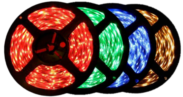
RGB + White

The Spectrum Series 24 Volt RGBW Indoor System from Inspired LED is a creative, customizable way to add a splash of color to your world! Available in custom lengths or 5 meter reels, these unique strips provide a range of up to 65 million color combinations. Energy efficient, long lasting, and dimmable with compatible systems, Inspired LED flex strips are the perfect option for any lighting application.