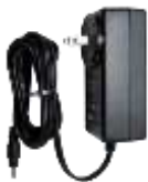
(1) 3.8A Power Supply