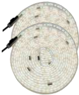
(2) Silicone Jacketed Mega Bright Pure White Flexible LED Strips